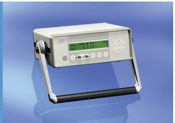
KAL 100/200: The perfect solution for mobile measurement and calibration of differential pressure within cleanrooms

Pressure monitoring and control in clean-rooms with differential pressure transmitter halstrup-walcher P26